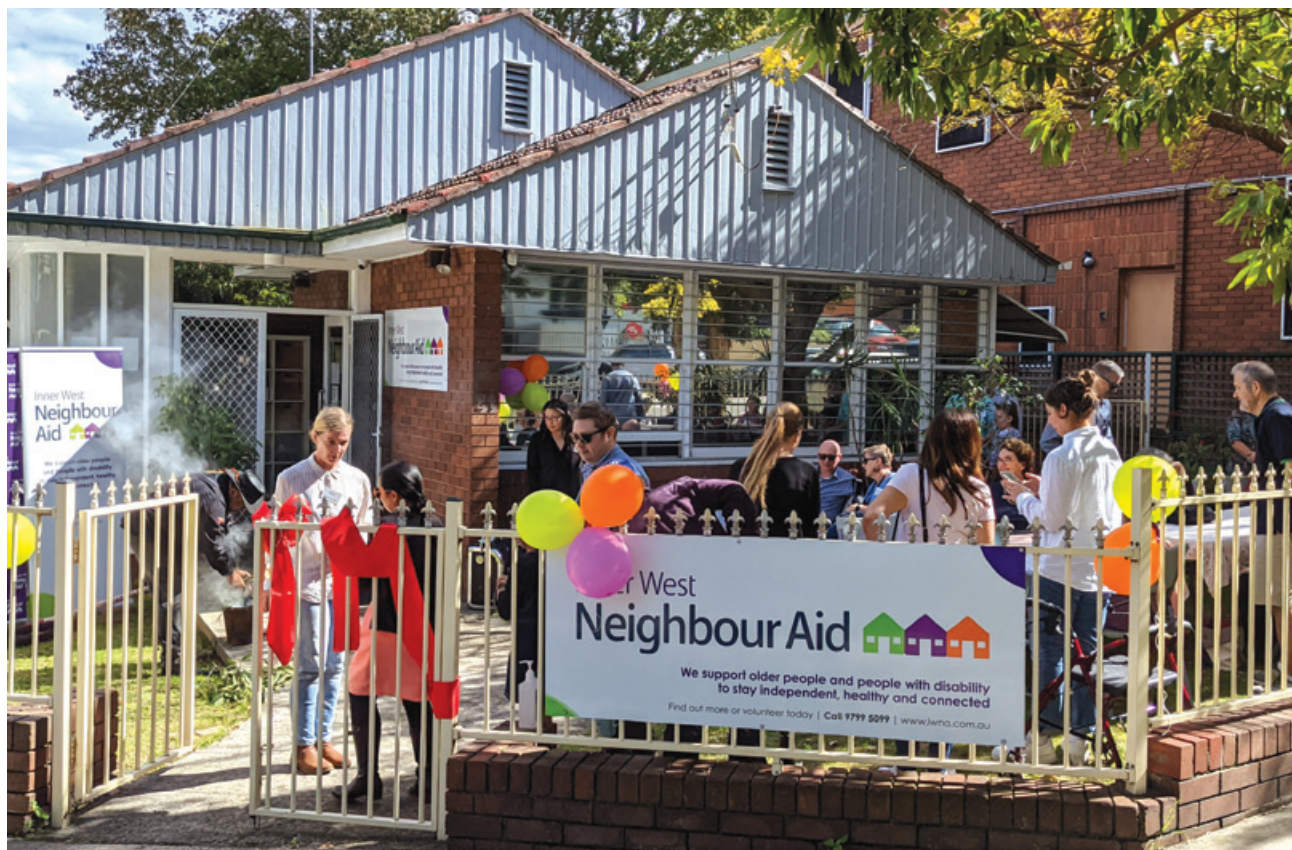
Opening of the new office, April 2021