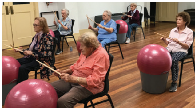
Drumming sessions, Alive and Kicking