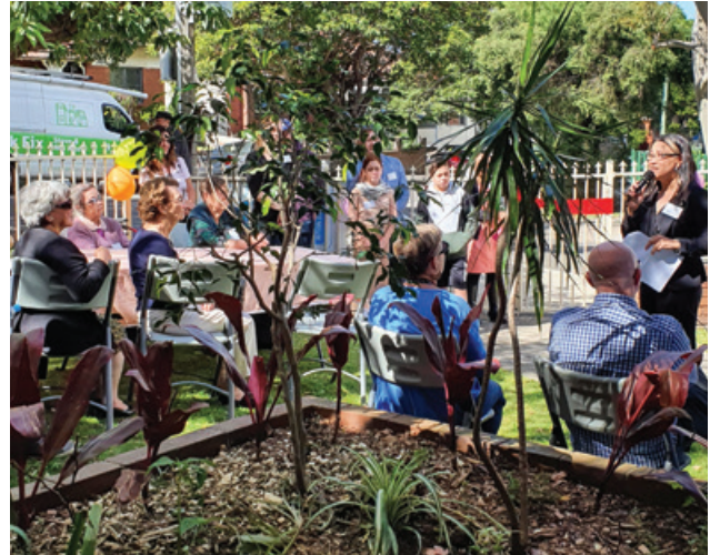
Opening of the new office, April 2021