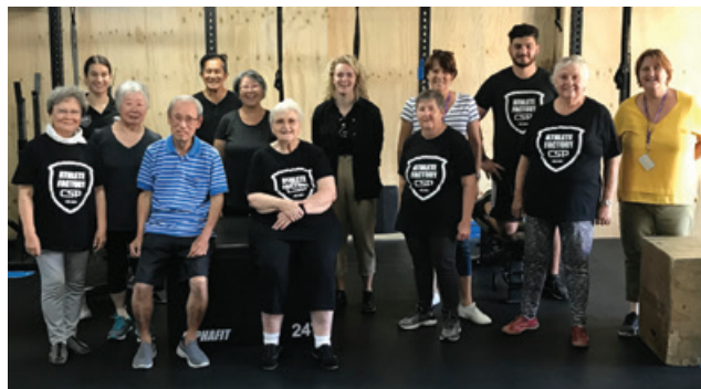
Clients, personal trainers and staff, Stand Tall

Grocery Shopping: Select students from Ashfield Boys High School are paired with local clients who are independent but require physical help with their grocery shopping.