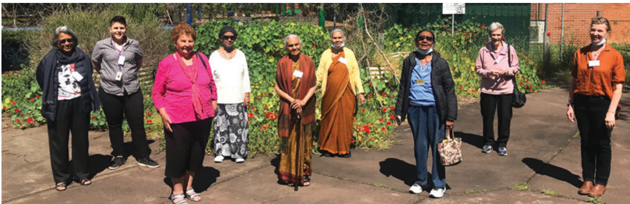
Clients and staff, Strathfield Aged Day Care

Strathfield Aged Day Care: Meeting up with new and old friends at the Strathfield Community Centre on Tuesdays, Wednesdays and Fridays. This group also includes a monthly outing, guest speakers, gentle exercise, bingo, great laughs and good times.